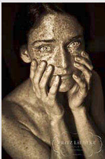
AstraVelum