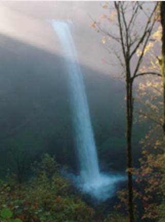
South Falls

This month we visit one of Oregon's scenic gems, Silver Falls State Park, about 2.5 hours from Portland in the Cascade foothills east of Salem.