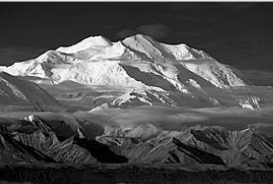
Denali

Plan now to attend the opening reception for PPF's group show, 7-9 p.m., Friday, June 3 at the Multnomah Arts Center Gallery. Light refreshments will be served during the reception.